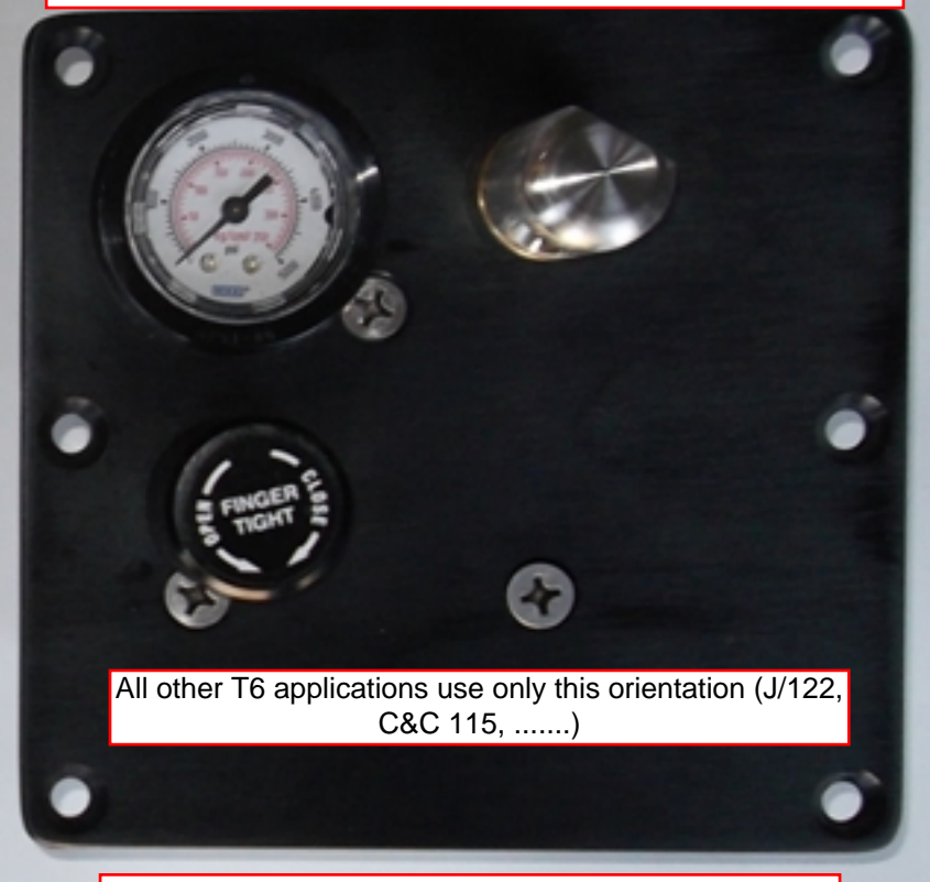
T6FB Remote Panel Pump Version III (current)

T6FB Remote Panel Pump Version III Face plate screw holes oriented for easier installation.