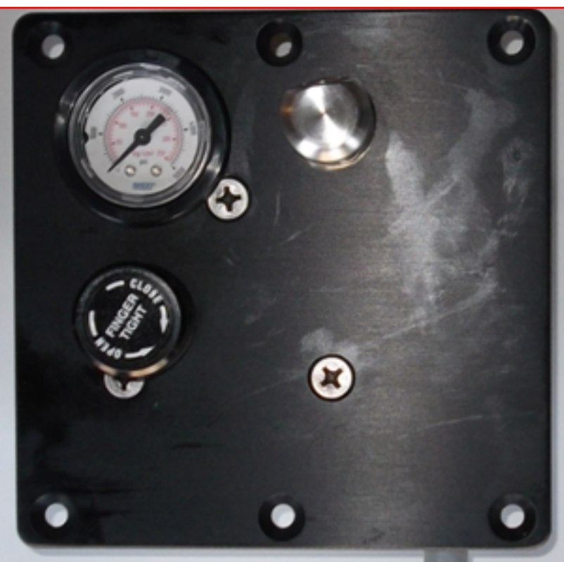
T6FB Remote Panel Pump Version II (available)

T6FB Remote Panel Pump Version II Pump rotated counter clockwise 90 degrees. Face plate screw holes match up with Version I.