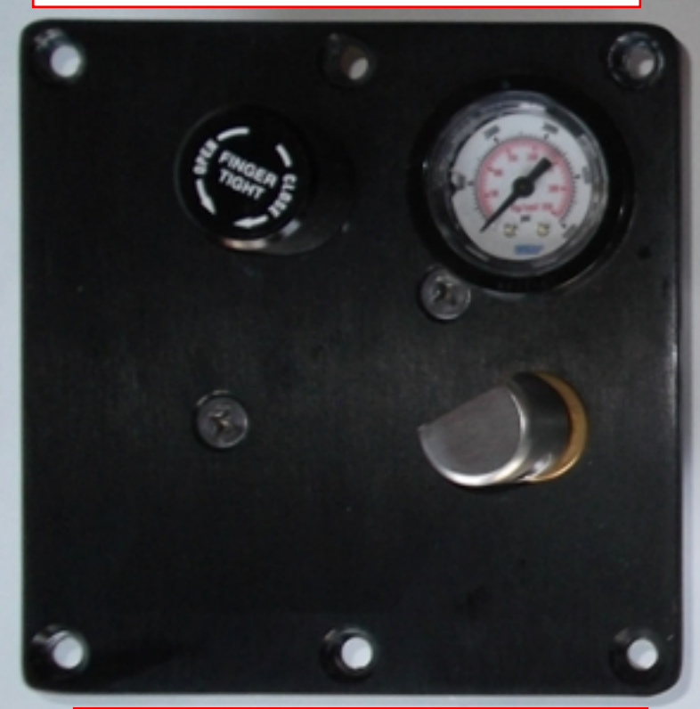
T6FB Remote Panel Pump Version I (discontinued)

T6FB Remote Panel Pump Version I As shown with screw holes across top of face plate.